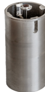
Over-run brake (optional)