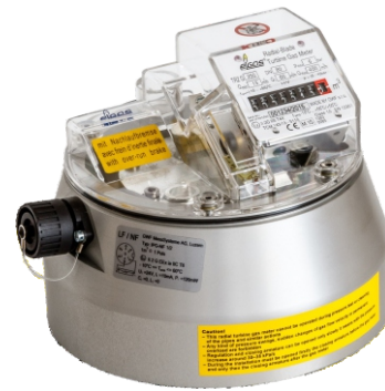
Radial-blade turbine gas meter head