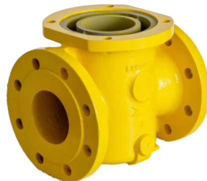
Monopipe adaptor EAS

light weight, in any installation arrangement and low cost. However gas meters with the velocity measuring principle are not ideal for intermittent operation. When an energy consuming installation is suddenly switched off, the meter does not react immediately. The freely moving turbine wheel continues to rotate at a slowly decreasing speed and will produce an error. In such case this error can be eliminated by installation of over-run brake.