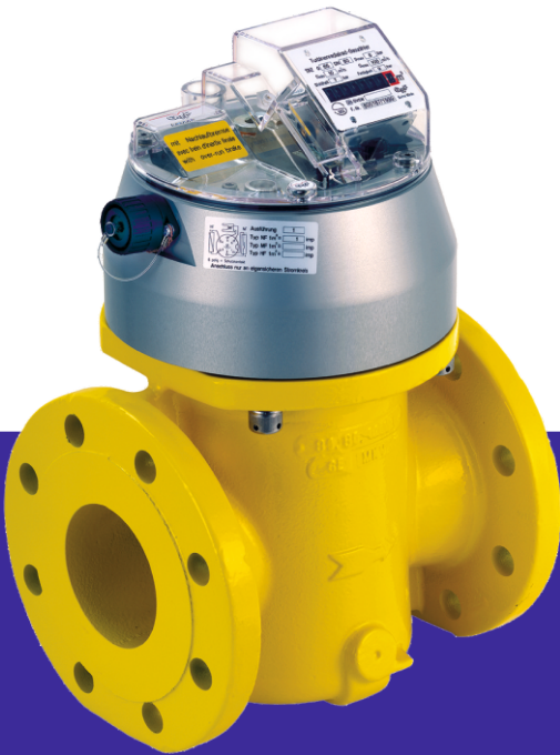
TRZ, EQZ, EQZK

ELGAS radial-blade turbine meter is a velocity meter designed for industrial and commercial use.