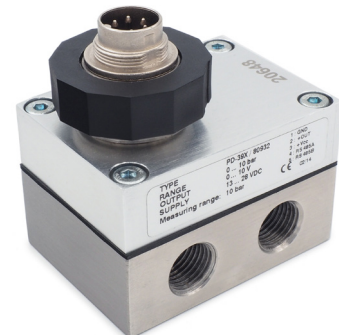
Medium Pressure Version