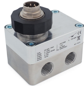
Low Pressure Version